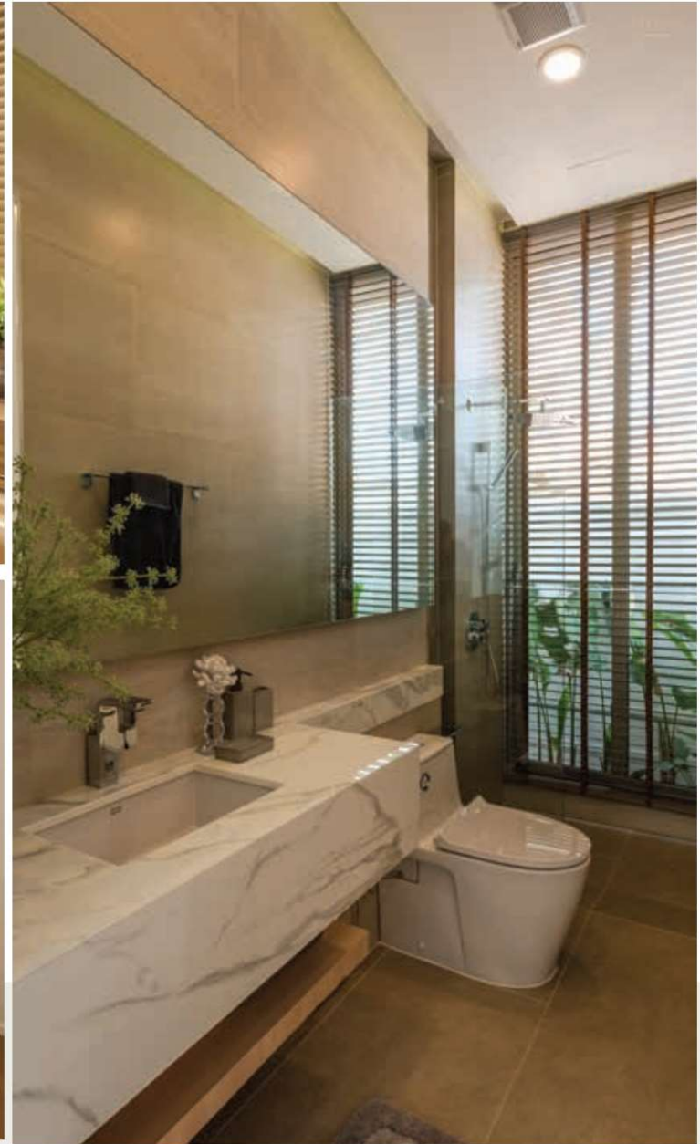
GUEST BEDROOM I